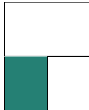
Quarter Page 3.75"w x 4.75"h